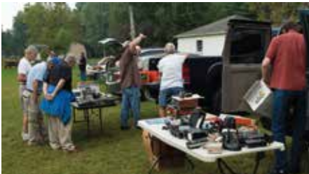
Reminiscing back to when tailgates were tailgates.

YOU ARE INVITED TO JOIN US FOR A GREAT TIME